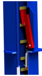
Automatic load holding system