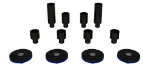
Extensions and lifting pads adapters