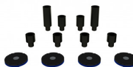
Extensions and lifting pads adapters