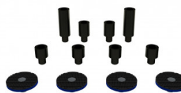
Extensions and lifting pads adapters