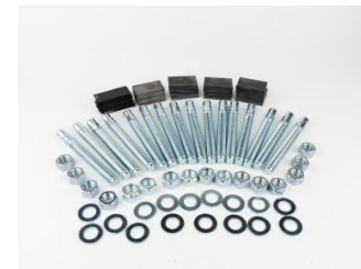
Wedge anchors and shims kit