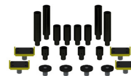
Extensions and lifting pads adapters